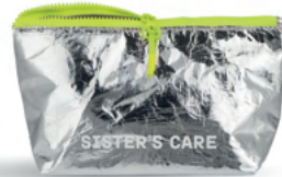
SISTER'S CARE COSMETIC BAG