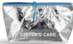
SISTER'S CARE COSMETIC BAG BLUE