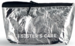
SISTER'S CARE COSMETIC BAG BLACK