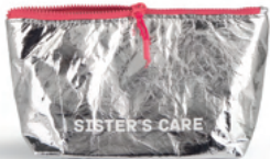
SISTER'S CARE COSMETIC BAG PINK